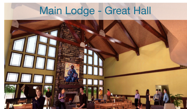
Main Lodge - Great Hall