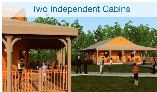
Two Independent Cabins