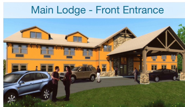
Main Lodge - Front Entrance