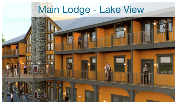
Main Lodge - Lake View